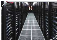
Telecom base station